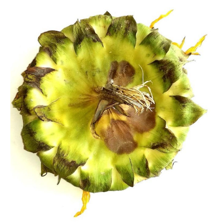
Fig. 1. The first appearance of white rot disease in a basket of sunflowers.